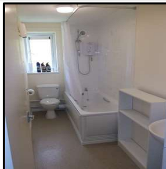
Final Checks and Handover