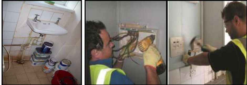
Bathroom Removal Electric Rewire Plastering / Patch