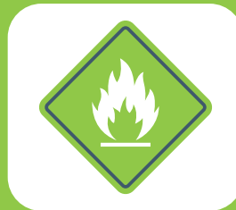
Storage of flammable liquids and gases