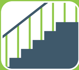
Any communal areas such as corridors and stairwells that are blocked