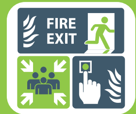
Signage, to help people know what to do if a fire happens and their exit route

We then take action if we spot something which will reduce the risk. So, for example, we've recently installed locked electrical points in some communal areas.